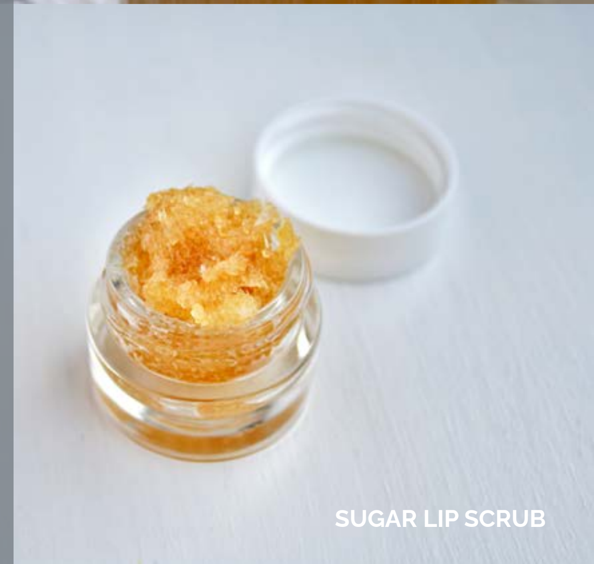
SUGAR LIP SCRUB